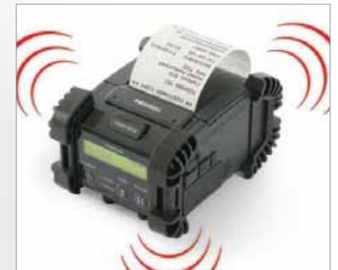
Wi-Fi certified (GH40 model)