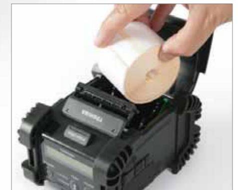
Market-leading media capacity for fewer roll changes