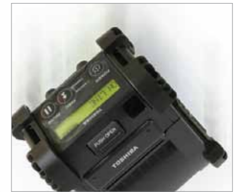
Robust and rugged, withstands a 1.8m drop on to concrete (1.5m for B-EP4)